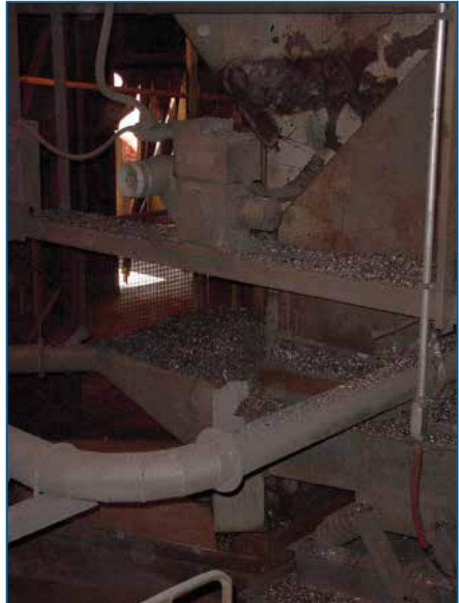
Sinter Plant Fines Gate Control