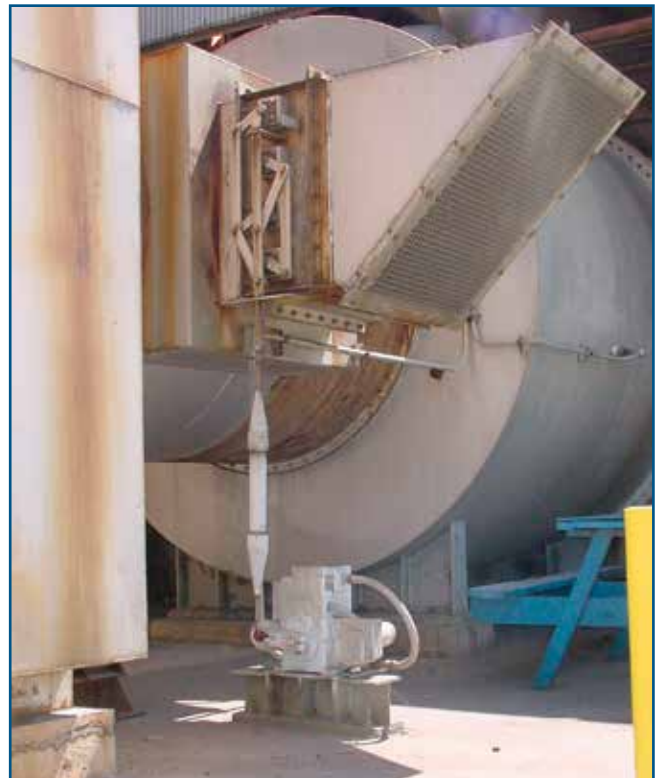
Melt Shop Fume Control Tempering Air Damper

Beck's Link-Assist™ program provides a printout showing the optimum actuator and linkage configuration for the application. The linkage arrangement can be characterized to match the torque profile of the application. Request this free service to save time, simplify installation and ensure the best performance at the lowest possible cost.