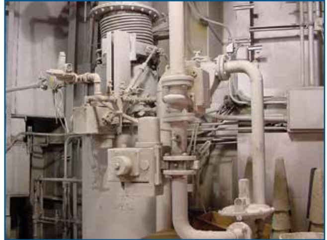
A & P Line Gas Valve