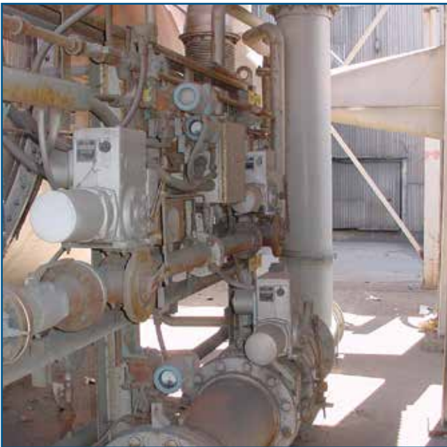
Stove Enrichment Gas Valves