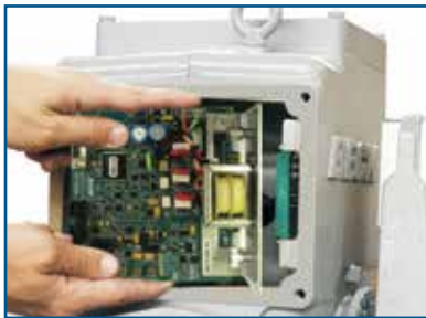
Digital Control Module (DCM)

Beck's Contactless Position Sensor (CPS) also resides within the drive, and provides reliable internal position feedback to the DCM for position control. The DCM also uses the sensor signal to source a 4–20 mA external position signal for remote monitoring of drive position. Unlike typical position sensors, the CPS does not wear due to its contactless design.