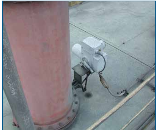
Lime Kiln Primary Air Damper