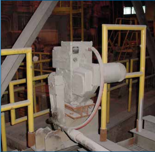
Reheat Furnace Exhaust Damper