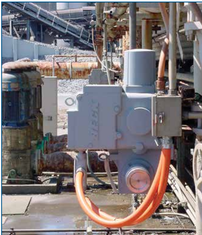
Recycle Water Control Valve

Beck actuators offer easy installation and can be mated to almost any final control element. Years of experience and expertise make it possible for Beck to custom fabricate all types of mounting hardware, adaptors and pedestals for simple drop-in replacement. Beck ensures a trouble-free installation.