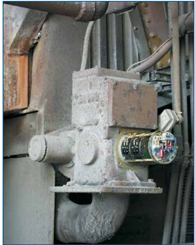
Group 11 drive with the gasketed control end cover removed