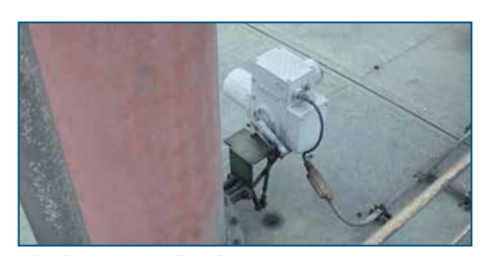
Kiln Reverse Air Fan Damper

Contact a Beck Sales Engineer at 215-968-4600 to find out more about the best actuators for your installations. Visit our website at <a href="www.haroldbeck.com">www.haroldbeck.com</a>. E-mail: sales@haroldbeck.com