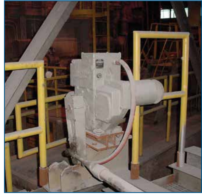
Furnace Combustion Air Damper