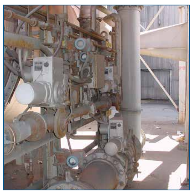
Pre-melt Furnace Gas & Air Valves

Beck actuators provide tight, responsive position control under the most demanding modulating conditions. This precise control makes Beck actuators a key element for improved process efficiency, reduced energy costs and reduced emissions.