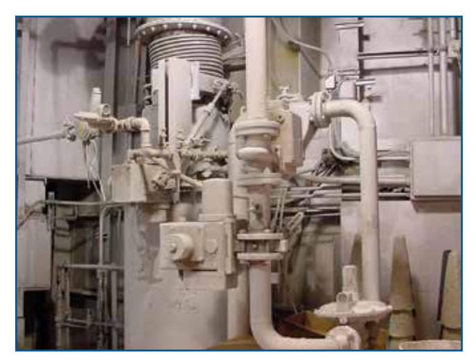
Melting Furnace Gas Valve