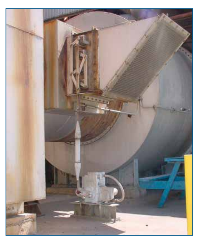
Mixing Air Bottom Damper

Beck's Link-Assist™ program provides a printout showing the optimum actuator and linkage configuration for the application. The linkage arrangement can be characterized to match the torque profile of the application. Request this free service to save time, simplify installation and ensure the best performance at the lowest possible cost.