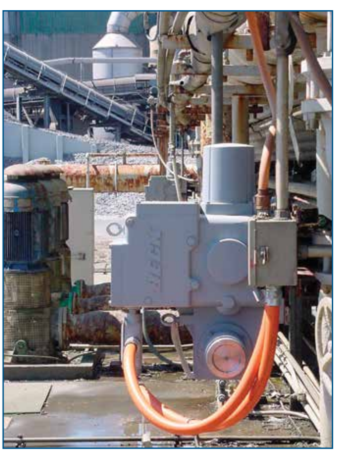
Water Control Valve